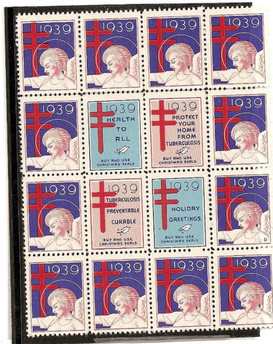
1939 slogan block