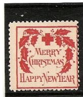
1907 type two