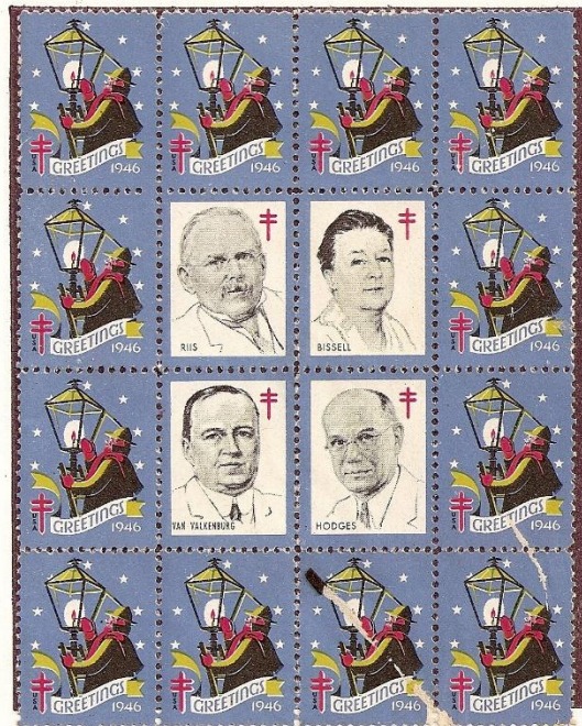
1946 portrait block