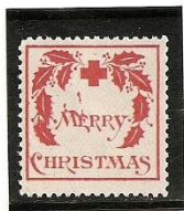
1907 type one