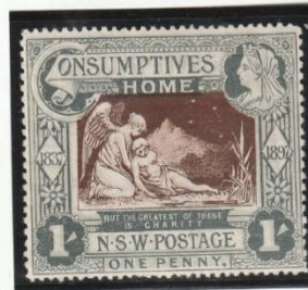
1 st Stamp to Fund Tuberculosis New South Wales Semi-Postal 1897