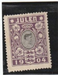
World's 1 st Christmas Seal Denmark, 1904