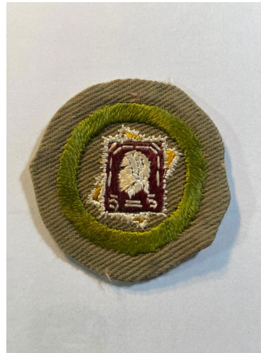
Type B Crimped Edge