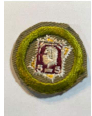
Type C Used 1936 - 1942