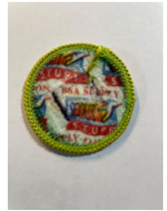
Type J Back w logo