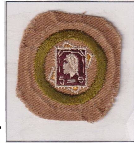
Fig. 1 Type A Badge