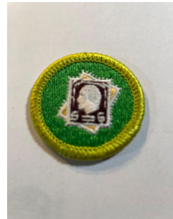
Type J Front