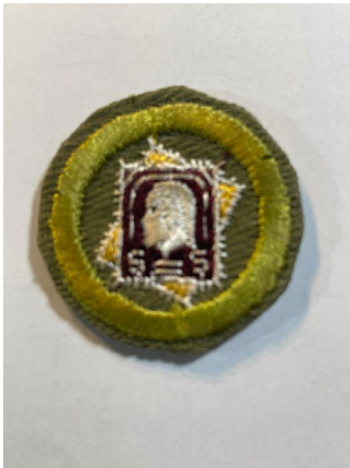
Type E Used 1947 to 1960