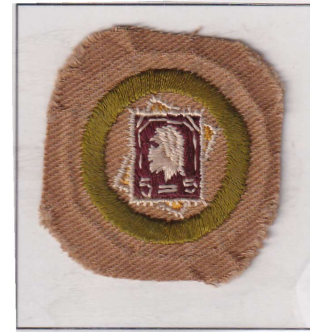
Fig. 1 Type A Badge