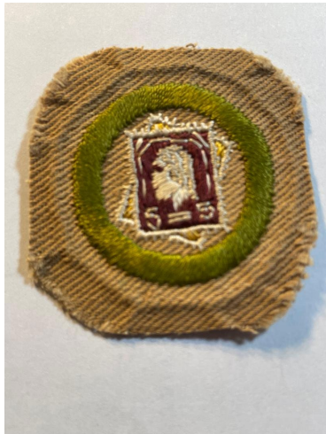
Type A "Original"