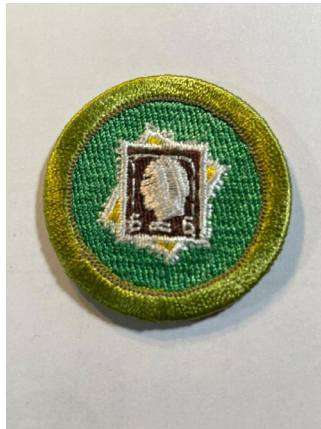
Type 1 Used 1993 to 2002