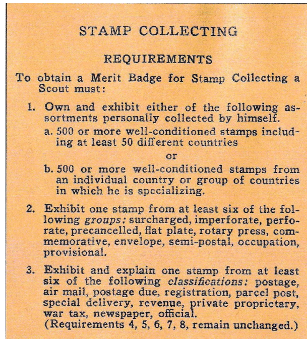
Fig 3. Initial Badge Requirements