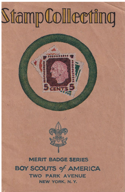
Fig 2. Initial Manual Cover